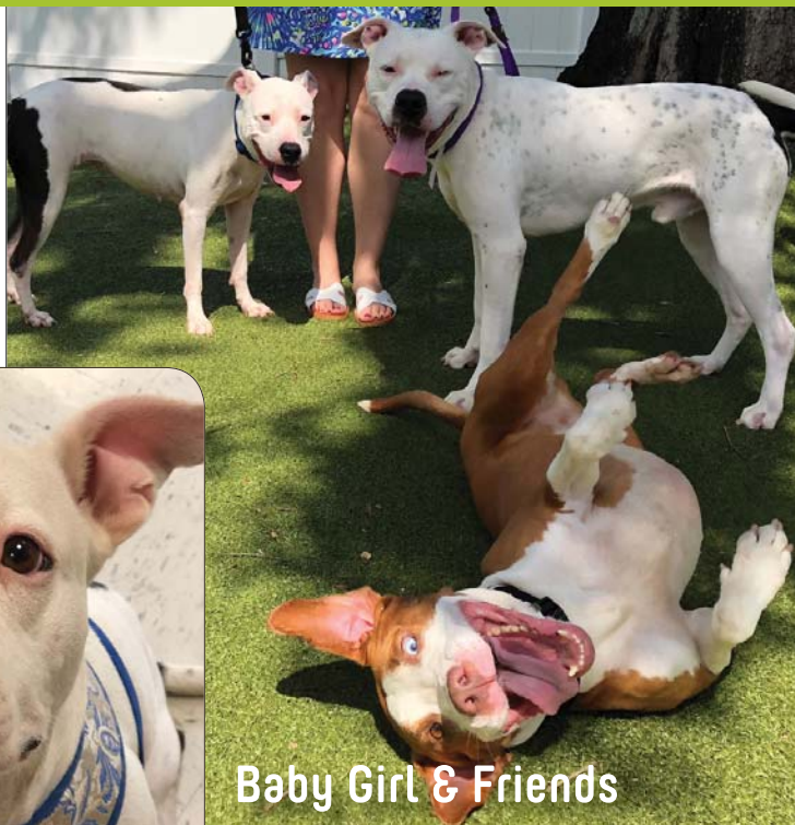
Baby Girl & Friends

One afternoon, a loving family came into the shelter