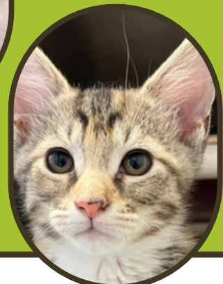
Nymeria and Lupa