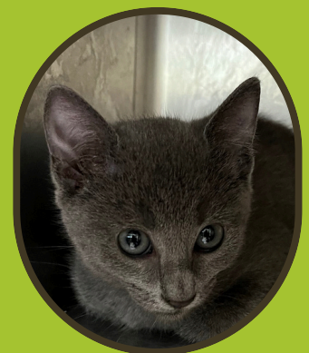
Goose and CiCi